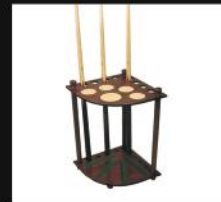
CUE RACK - MAHOGANY