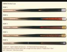
CUE STICK - OMIN