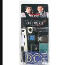
CUE CARE KIT