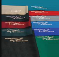
CLOTH - IWAN SIMONIS