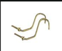
EXTENSION HOOK - BRASS