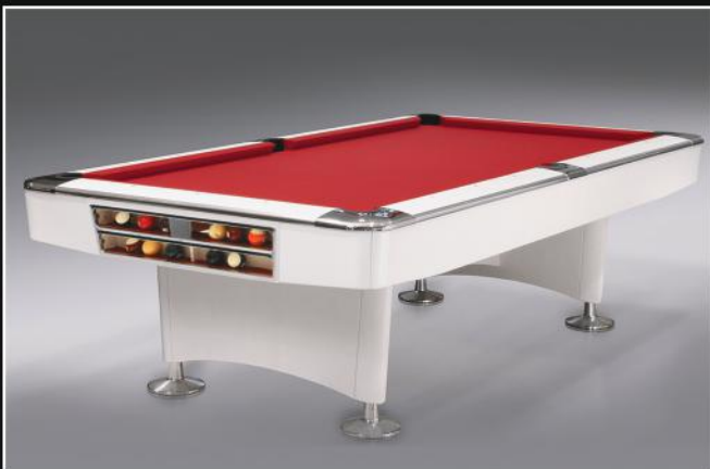
OLYMPICO POOL BILLIARD- CAVICCHI