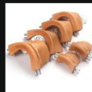
POCKETS - LEATHER