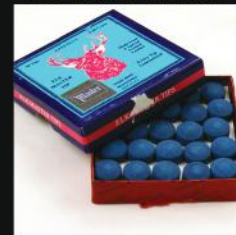
CUE TIPS - TWEETEN