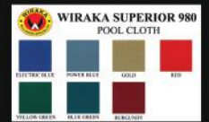
CLOTH - WIRAKA SUPERIOR 980