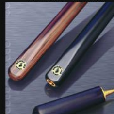
CUE STICK - MASTER