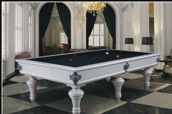
LEONARDO BILLIARD LACQUERED