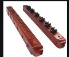
CUE RACK - WOOD