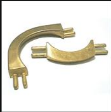
CORNER PLATES - BRASS