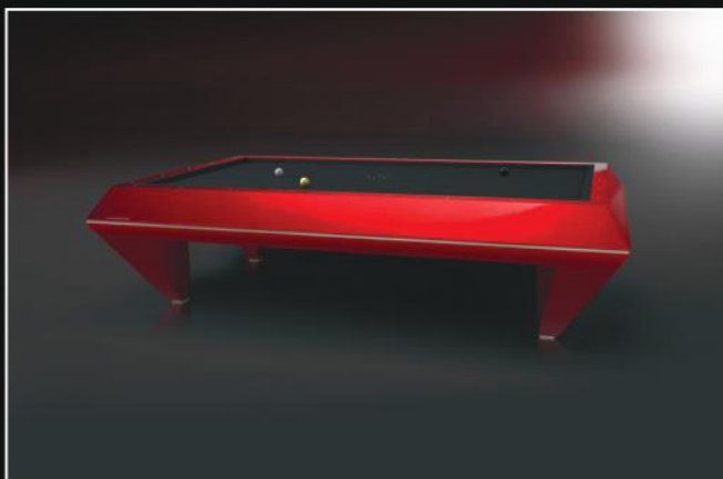
LACQUERED F1 POOL BILLIARDS