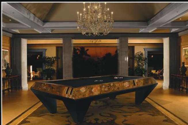
BILLIARD MILLENIUM KLIMT GOLD LEAF

biliardi cavicchi il biliardo Campione del Mondo