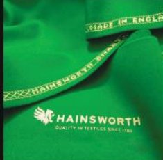
CLOTH - HAINSWORTH