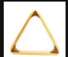
TRIANGLE - WOODEN