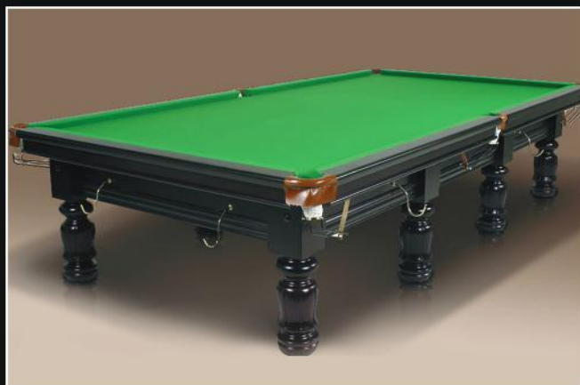
SNOOKER PROFESSIONAL- CAVICCHI