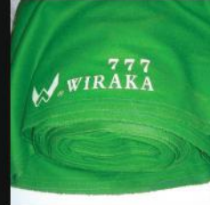
CLOTH - WIRAKA 777