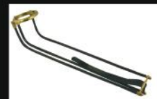
RAILING POCKET - BRASS