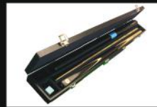
CUE CASE - WIRAKA