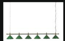
POOL TABLE LIGHTING