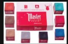
CHALK - MASTER