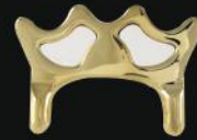
BUTT HEAD - BRASS