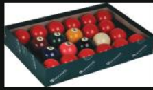
BALL SET SNOOKER - ARAMITH