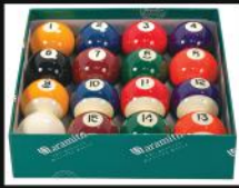
BALL SET POOL - ARAMITH