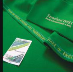
CLOTH - STRACHAN 6811