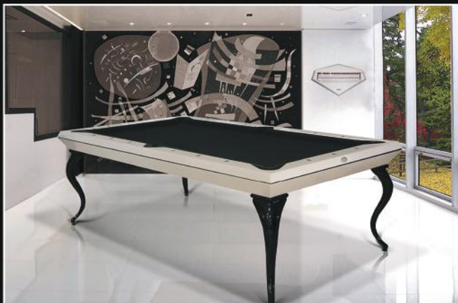
OPERA POOL BILLIARD TABLES