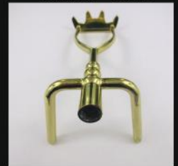
EXTENDED SPIDER - BRASS